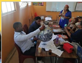
LEFT: PSP Life Skills courses with Foundation Phase teachers received positive feedback.

PSP advances science teaching through the projects