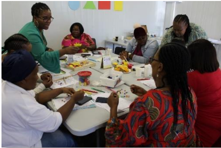
Foundation Phase teachers discussing Patterns in the course held in January. Courses are run in isiXhosa and English.

A young child who can understand numbers, sort objects and see and make patterns is set to fly in Mathematics at school and will build on this critical foundation for future success. The importance of the Foundation Phase teacher therefore cannot be overstated – it all starts here!