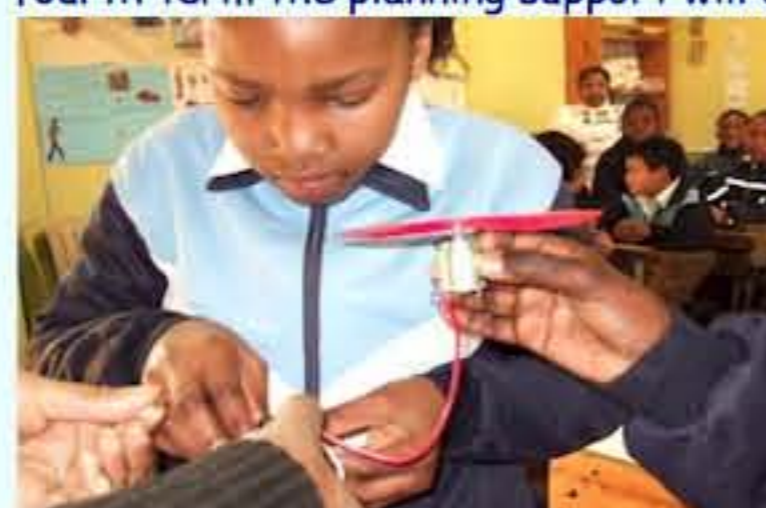
Grade 5 learners at Surrey Primary using electricity to make a fan

In the PSP Cluster Project our facilitators are developing good relationships with teachers where they welcome the PSP facilitators into their classroom as a support. The PSP is assisting teachers to implement their NS plans in class. In the fourth term the planning support will continue as well as the school support visits.