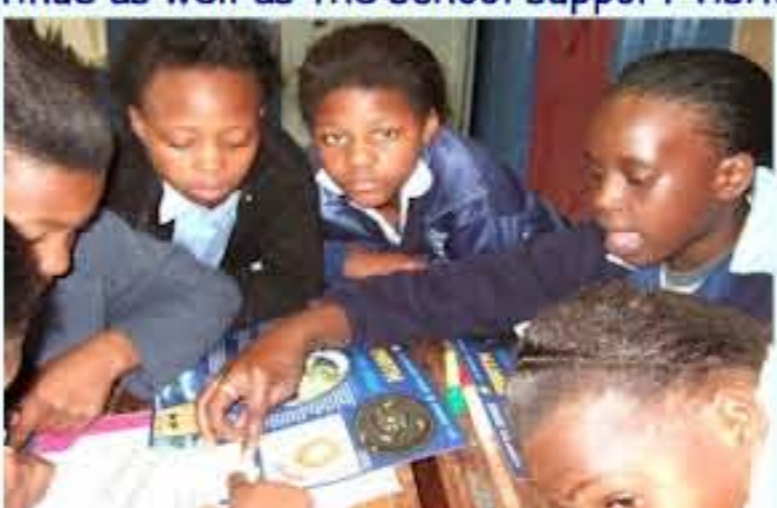
Grade 6 learners from Vusamanzi Primary using the Astronomy Cards to do research