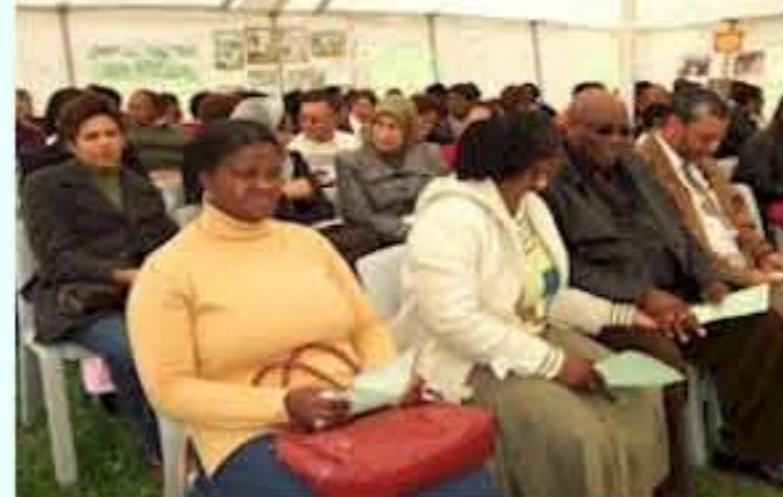
More than 140 teachers participated in the PSP Annual Mass Planning Forum to decide on the priorities for Teacher Support in 2008.

We are grateful for the teachers' engagement with us!