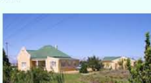
Edith Stevens Wetland Park

We will move in January 2003 and we will keep you informed about the new contact numbers.