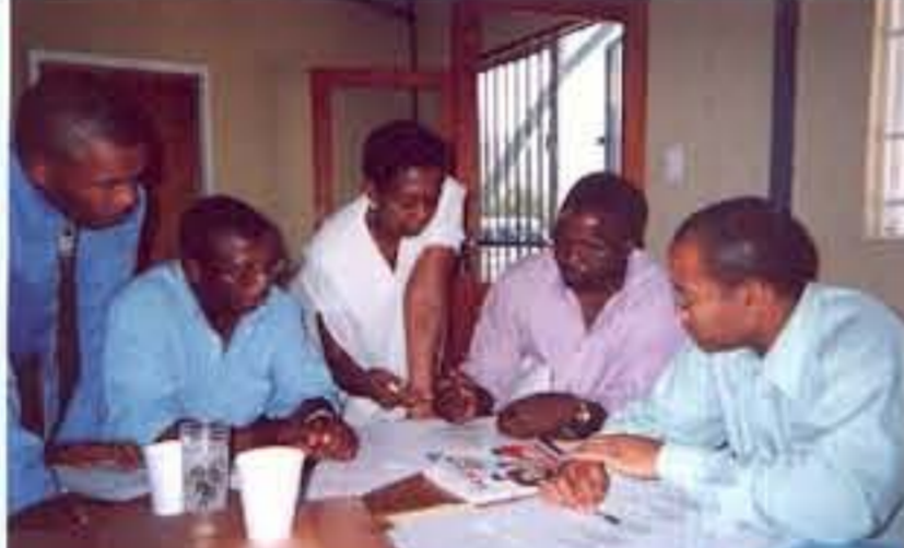
Many, many teachers attended the PSP courses on Assessment last term.

We hope to write up these investigations in the form of support materials for teachers.