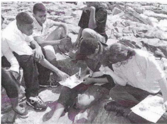
Grade 7 learners from Delta Primary School enjoyed their visit to the Rocky Shore in Kalk Bay, facilitated by the Table Mountain National Park.