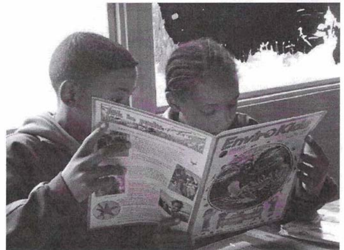
Grade 4 learners at Kenmere Primary School absorbed in EnviroKids .

Facilitators visited teachers during October and November to support those who wished to use the magazine in their lessons.