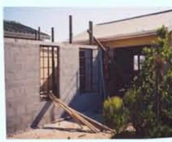
The new PSP offices at Edith Stevens Wetland Park will be ready soon.